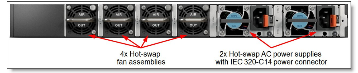
Figure 3. Rear panel of the RackSwitch G8272

The following figure shows the rear panel of the RackSwitch G8272.